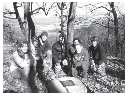
Members of Circle K on the Mountain.